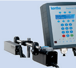
GraphicJet & controller P-series

The P-Series offers foolproof reliability and piezo functions for a basic price