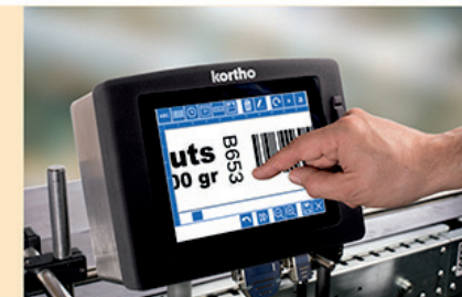
TsC20 Controller X-series

The Highest Industrial quality from the Netherlands